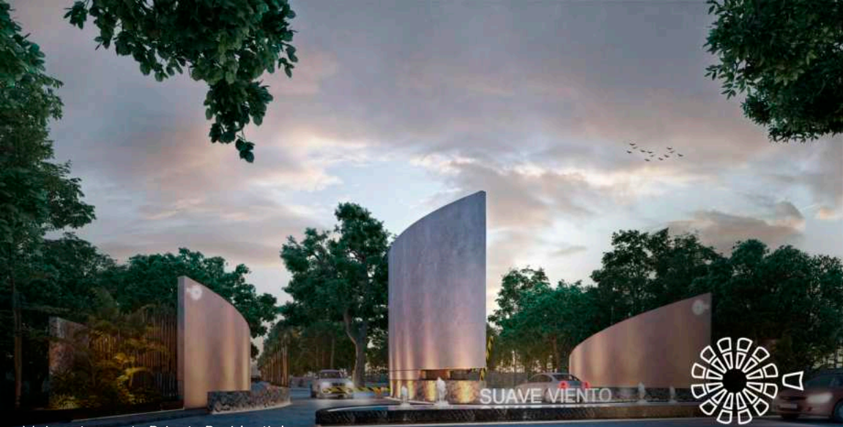
Main entrance to Private Residential.